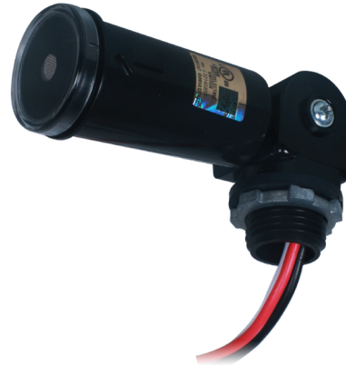
Stem and Swivel Photocell