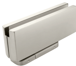
PFD-HYD (Closed base)