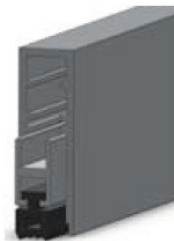
Figure 3 - Improper Drop Bar

NOTE: Under no condition should the insert project beyond the edge of the case.