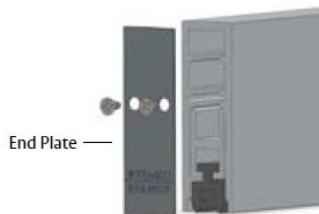
Figure 4 - Properly Installed End Plate

This shows a properly installed end plate. Do not use power tool to tighten screw.