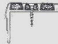
WOOD or MACHINE SCREWS

Treads being superimposed on existing stairs can be furnished pre-drilled and ctsk. for wood, machine or Tapcon screws. Standard spacing is 3" (76.2 mm) in from each end, approx. 12" (304.8 mm) centers, in single, staggered, or double row, according to tread width. Will furnish #10 screws.