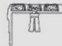
SCREW & SHIELDS