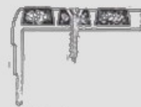
SILVER TAPCON SCREWS,