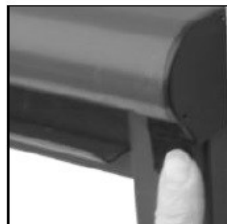
Push Button To Retract Screen

If Screen is Removed & Re-Applied, engage the 2 strips of 3M Dual Lock® by Applying Firm Pressure until a snapping sound is heard.