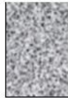
*Gray Hammertone (GH)