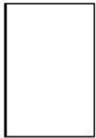
*White (W) White Hammertone