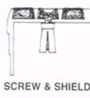
SCREW & SHIELDS

Treads being superimposed on existing stairs can be furnished pre-drilled and ctsk. for wood, machine or Tapcon screws. Standard spacing is 3" (76.2 mm) in from each end, approx. 12" (304.8 mm) centers, in single, staggered, or double row, according to tread width. Will furnish #10 screws.