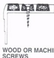
WOOD OR MACHINE SCREWS