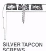
SILVER TAPCON SCREWS