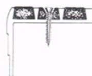
SILVER TAPCON SCREWS