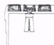
SCREW & SHIELDS

Treads being superimposed on existing stairs can be furnished pre-drilled and ctsk. for wood, machine or Tapcon screws. Standard spacing is 3" (76.2 mm) in from each end, approx. 12" (304.8 mm) centers, in single, staggered, or double row, according to tread width. Will furnish #10 screws.