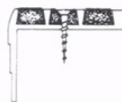
WOOD OR MACHINE SCREWS