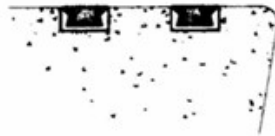
Detail - recessed into concrete step

WP-24 is recognized among CALIFORNIA TITLE 24 NOSINGS